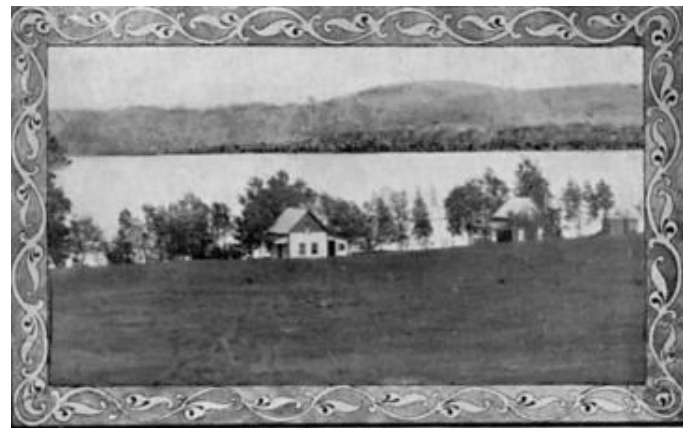
Post card, from the State of Vermont archives, circa 1907, Patton Shore.