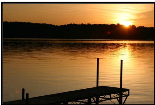
Dreams of summer time at Lake Carmi!