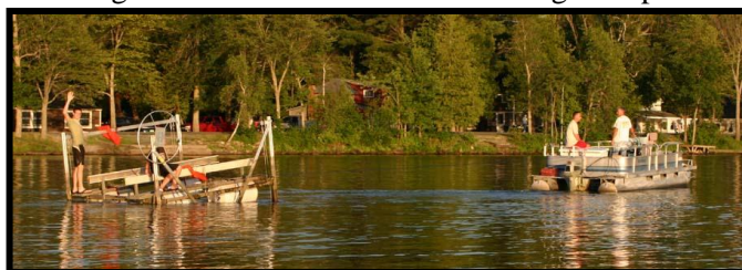
Note the two riders on the hoist.

Last summer found Bob Larose of Hammond Shore Road moving this boat hoist from Dewing Shore Road to the far end of Hammond Shore. Floating down the lake was no big deal according to Bob. It just took four large barrels for floatation and the right helpers.